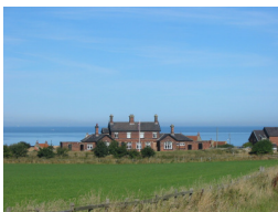
The hamlet of Kettleness (Runswick Bay lies to the left)

It has lovely open sea views, being perched upon the cliff top. This part of the East Coast is the highest and forms part of the northern coastal boundary of the North York Moors National Park.